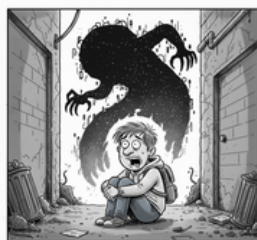
THE AI SYLLABUS STATEMENT